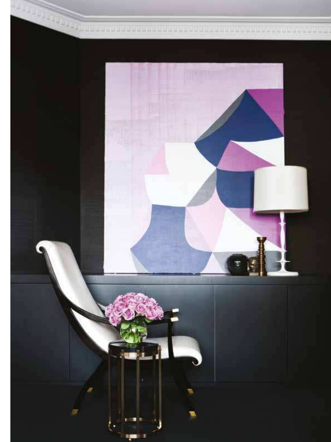
The dark space instantly lit up with some light coloured furniture and artwork.